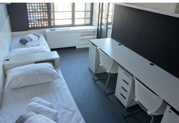
photo 9-12 - example of double room

MONTHLY PRICE PER BED: double room 532,50 HRK